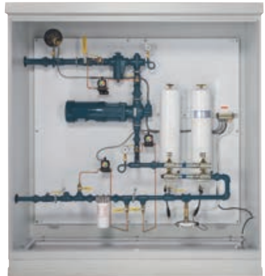
A small cabinet-mounted fuel maintenance system

The first step in fuel oil maintenance is to remove the water and filter out the particulate from the fuel in the storage tanks.