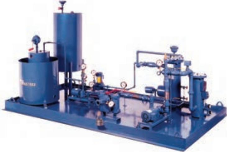
A large, skid-mounted system complete with chemical injection and a waste-holding tank

The next step is to prevent future microbial growth with a biocide treatment and maintain fuel quality by adding cetane boosters and stabilizers as necessary.